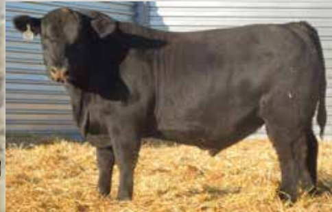
Lot 67 GC Legendary 9194