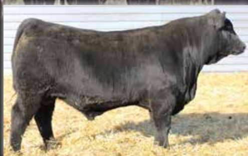
Lot 29 GC Caliber 0009