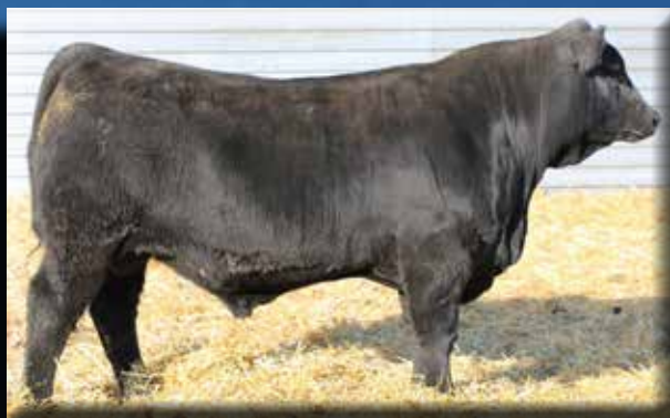
Lot 29 GC Caliber 0009