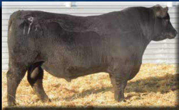
Lot 80 GC Stetson 9114 AAA *19666408