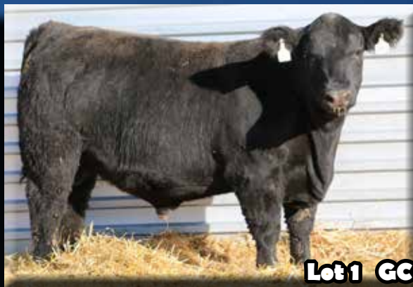
Lot 1 GC Epic 0024 AAA+*19863640