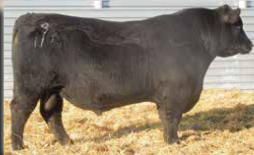
Lot 80 GC Stetson 9114