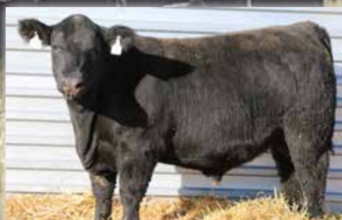
Lot 1 GC Epic 0024