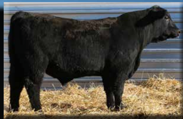
Lot 15 GC Special Agent 0052 AAA+*19820554

Selling Registered Angus & Composite Bulls Sons of :