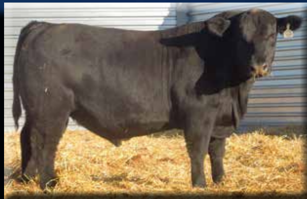
Lot 67 GC Legendary 9194 AAA+*19884325