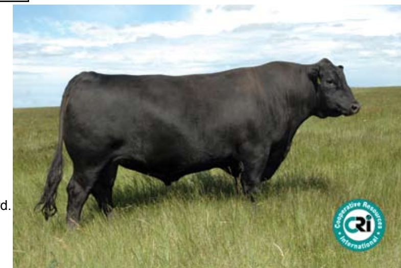
TC Aberdeen 759

Touch more Gelbvieh for that hybrid vigor for your herd.