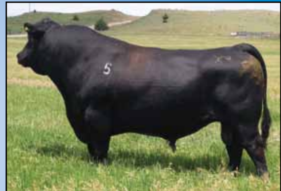
Sculptor of Amen GC