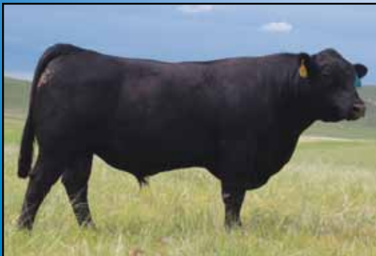
LT Aberdeen 9275